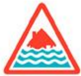
SEVERE FLOOD WARNING

Move family, pets and valuables to a safe place. Turn off gas, electricity and water supplies if safe to do so. Put flood protection equipment in place.